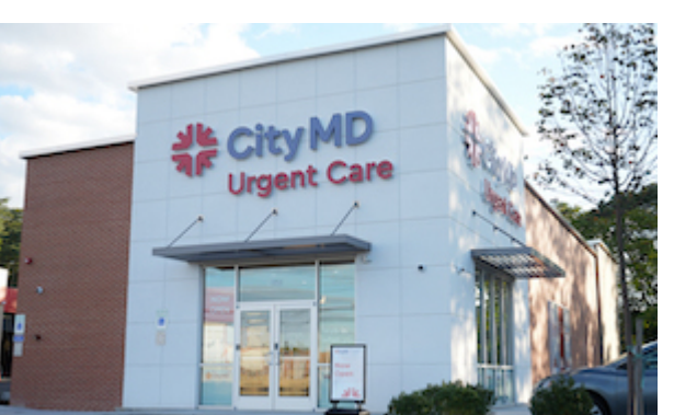
When You Can't Wait for Care Walk in or book an appointment at our urgent care partner CityMD – open 365 days a year. You can also meet with a doctor online for a