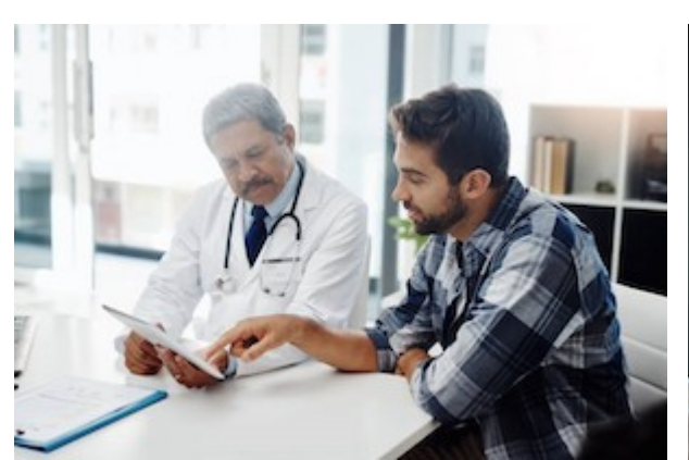
About New Male Infertility What is Disc Replacem Surgery?