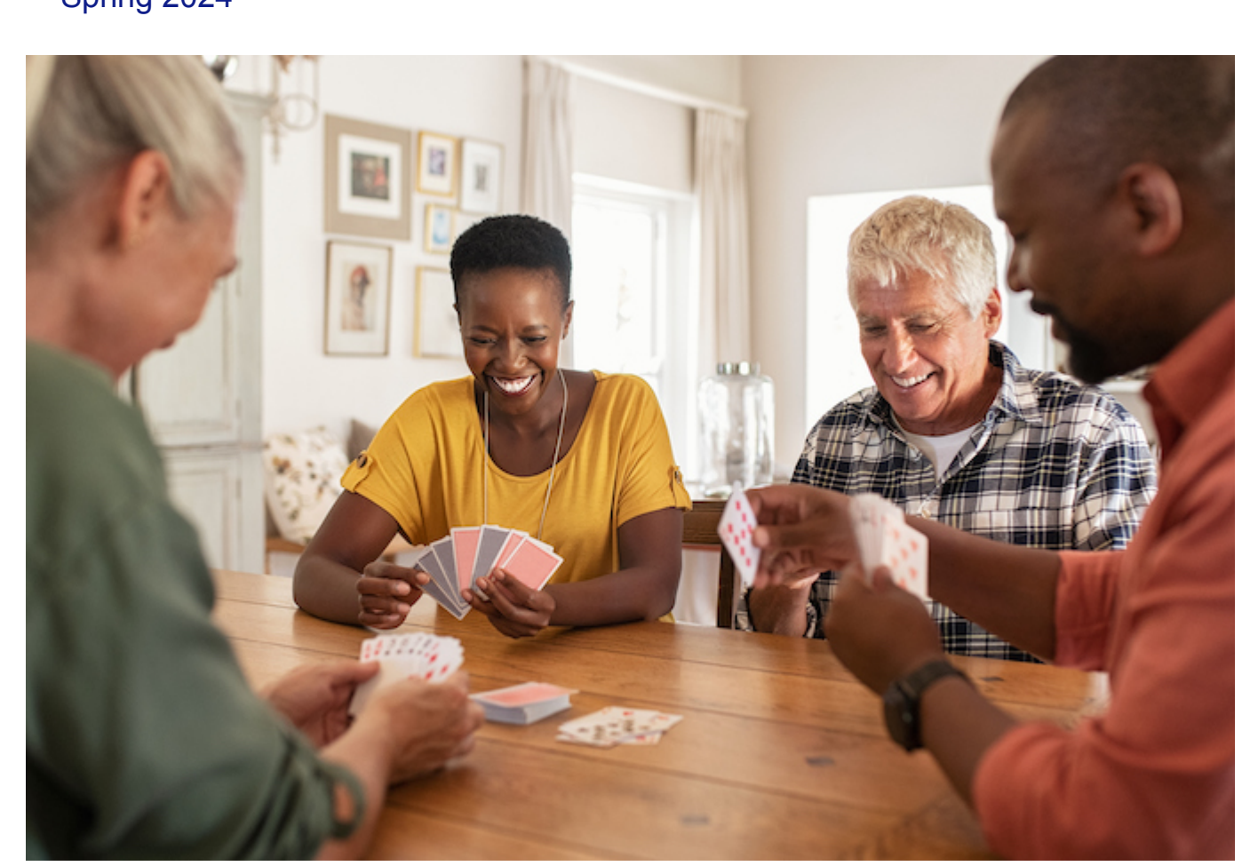
Memory Loss: What's Normal and What Isn't?